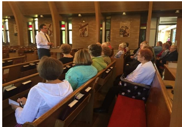
EAST CENTRAL DISTRICT MEETING 2017