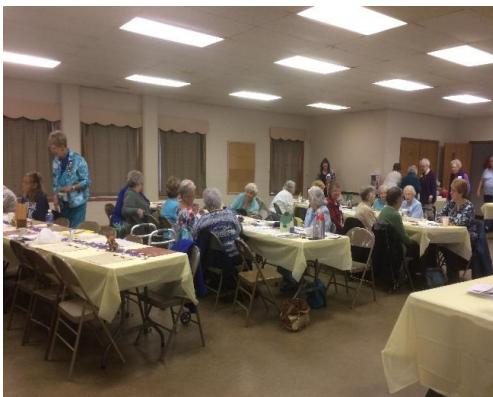
SOUTHWEST DISTRICT MEETING 2017